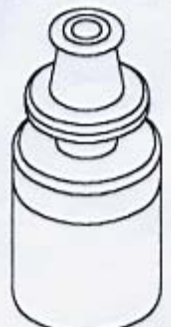
30-19064 XH(With SEAL)-NOZZLE ID = 1.40 / OD = 3.02(4.0)