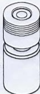
30-19951 BA(With SEAL)-NOZZLE ID = 3.43 / OD = 6.27