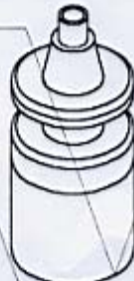
30-19057 XH-NOZZLE ID = 0.99 / OD = 1.40