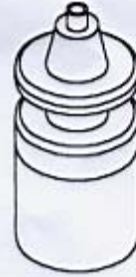
30-19054 XF-NOZZLE ID = 0.45 / OD = 0.76