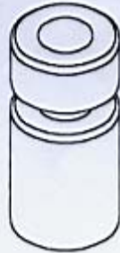
30-15532 BA-NOZZLE ID = 3.58 / OD = 6.20