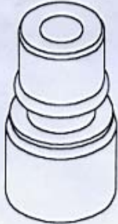
30-15531 AA-NOZZLE ID = 2.39 / OD = 4.11