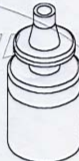
30-19058 XI-NOZZLE ID = 1.40 / OD = 2.16