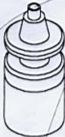
30-19055 XG-NOZZLE ID = 0.71 / OD = 1.02